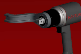
RAPTOR 1000 Weight 9 lbs

RAPTOR 1000 "SINGLE SPEED" TORQUE RANGE 250-1000 FREE SPEED 20 RPM