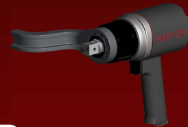
RAPTOR 500 Weight 8.5 lbs

RAPTOR 500 "SINGLE SPEED" TORQUE RANGE 120-500 FREE SPEED 35 RPM