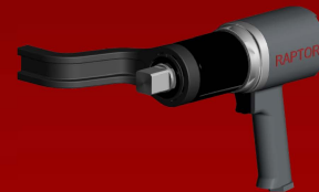
RAPTOR 2000 Weight 12.5 lbs

RAPTOR 2000 "SINGLE SPEED" TORQUE RANGE 450-2000 FREE SPEED 10 RPM